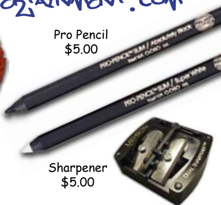
Pro Pencil $5.00