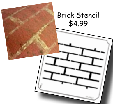
Brick Stencil $4.99