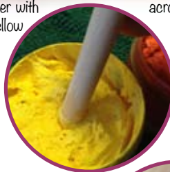
Slide the edge across orange