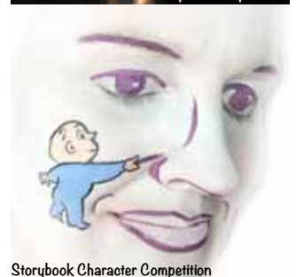
Storybook Character Competition