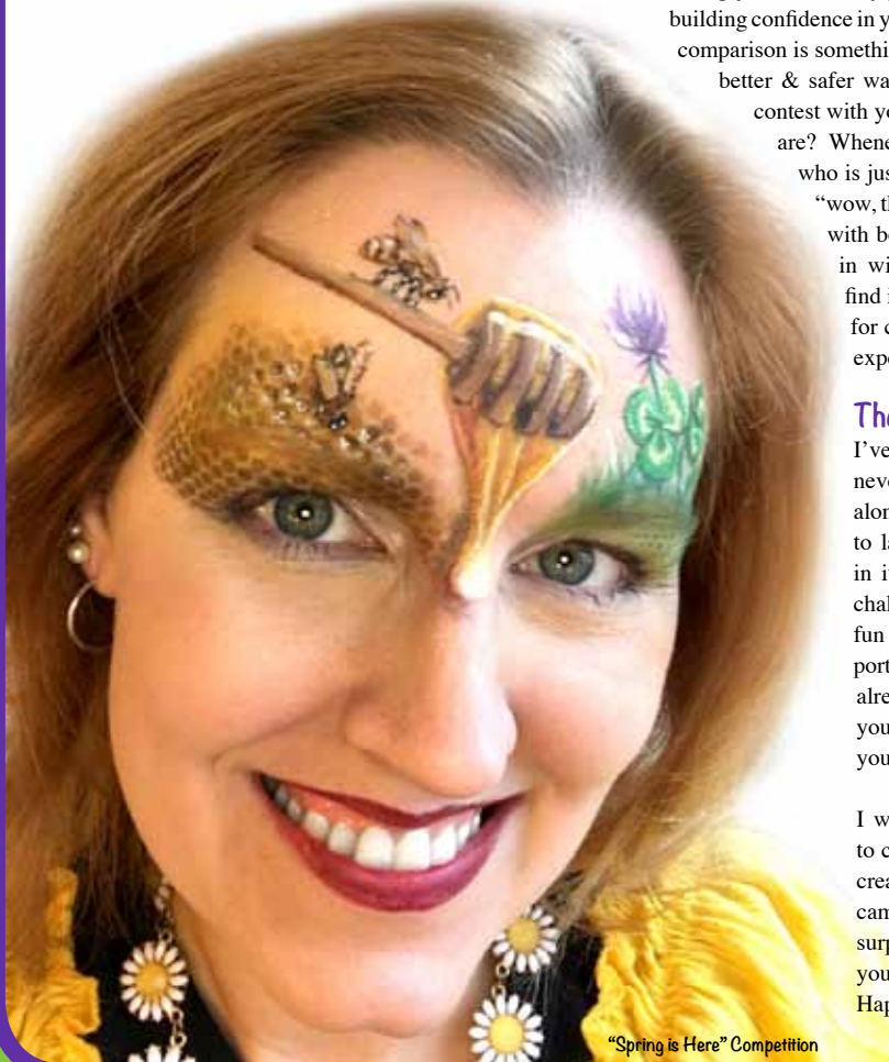
"Spring is Here" Competition