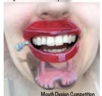
Mouth Design Competition