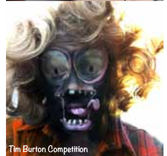
Tim Burton Competition